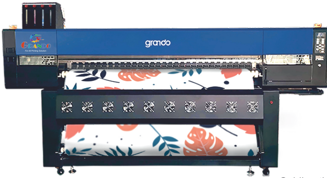
Twelve i3200 Head